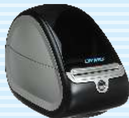
Barcode Label Printer